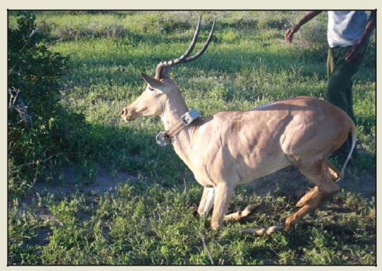
Plate 3: Releasing a collared adult female hirola in Arawale.

We fit three females in Arawale (Plate 3) and six females in Burathagoin with Vectronic Aerospace GPS Plus Iridium collars. In sum, the nine adult females that we GPS collared in 2012 belong to seven groups totaling 51 individuals. Conservatively, we estimate that this represents nearly 13% of the global population (King et al. 2011).