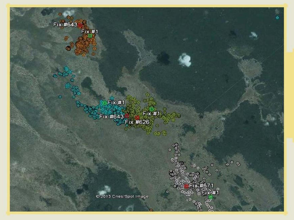
Plate 4: GPS movement trajectories of 4 hirola herds 1-31 January 2013 in the Burathagoin grazing fields. Note the pronounced avoid-ance of tree cover (dark green)

Collar batteries are expected to last for 4 years and will relay information in near-real time (within 24 hours) on habitat selection and movements. Interested parties are welcomed to monitor movements of hirola hersd at http://www.jakegoheen.com/index. php/research-group/abdullahi-hussein-ali.html. GPS radiocollars record GPS location every three hours throughout