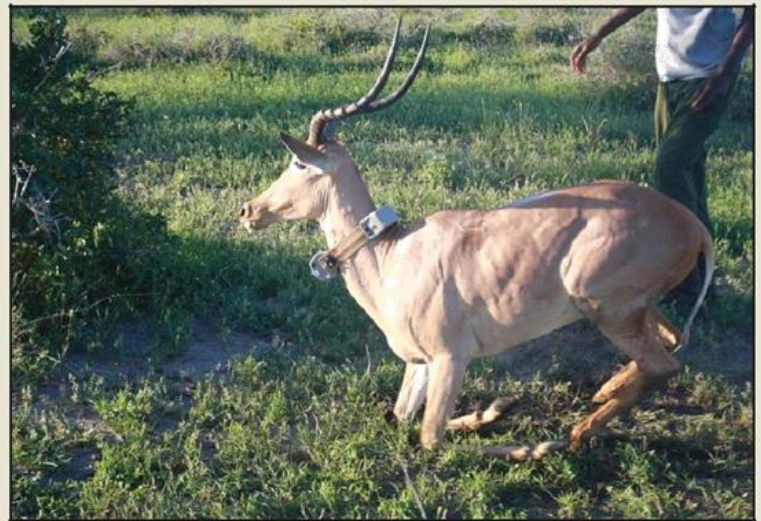
Plate 3: Releasing a collared adult female hirola in Arawale.

We fit three females in Arawale (Plate 3) and six females in Burathagoin with Vectronic Aerospace GPS Plus Iridium collars. In sum, the nine adult females that we GPS collared in 2012 belong to seven groups totaling 51 individuals. Conservatively, we estimate that this represents nearly 13% of the global population (King et al. 2011).