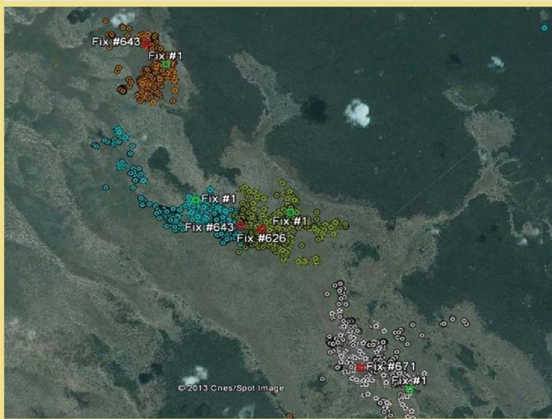
Plate 4: GPS movement trajectories of 4 hirola herds 1-31 January 2013 in the Burathagoin grazing fields. Note the pronounced avoid-ance of tree cover (dark green)

Collar batteries are expected to last for 4 years and will relay information in near-real time (within 24 hours) on habitat selection and movements. Interested parties are welcomed to monitor movements of hirola herds at http://www.jakegoheen.com/index.php/research-group/abdullahi-hussein-ali.html . GPS radiocollars record GPS location every three hours throughout